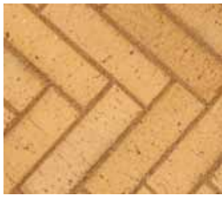
CHAMPAGNE PIAZZA PAVER PA 210 x 60 x 60mm (Chamfered) Springs Factory – Gauteng