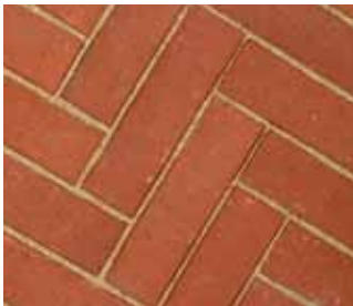
BURGUNDY PIAZZA PAVER PA 210 x 60 x 60mm (Chamfered) Springs Factory – Gauteng