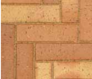
CEDERBERG PIAZZA PAVER PA 210 x 60 x 60mm (Chamfered) Springs Factory – Gauteng