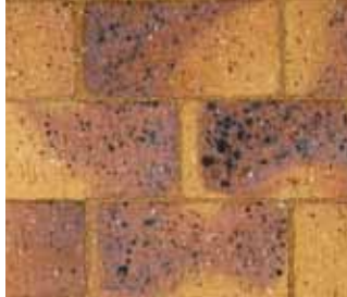
NAMAQUASTONE PAVER PB 220 x 108.5 x 50mm (Nibbed) Springs Factory – Gauteng