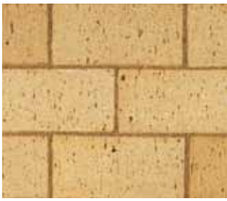
CHAMPAGNE PAVER PA (SABS 1575:2007) (ISO 9001:2008) 220 x 108.5 x 50mm/200 x 98.5 x 65mm (Chamfered and Nibbed). Available in special shapes and bullnose. Springs Factory – Gauteng