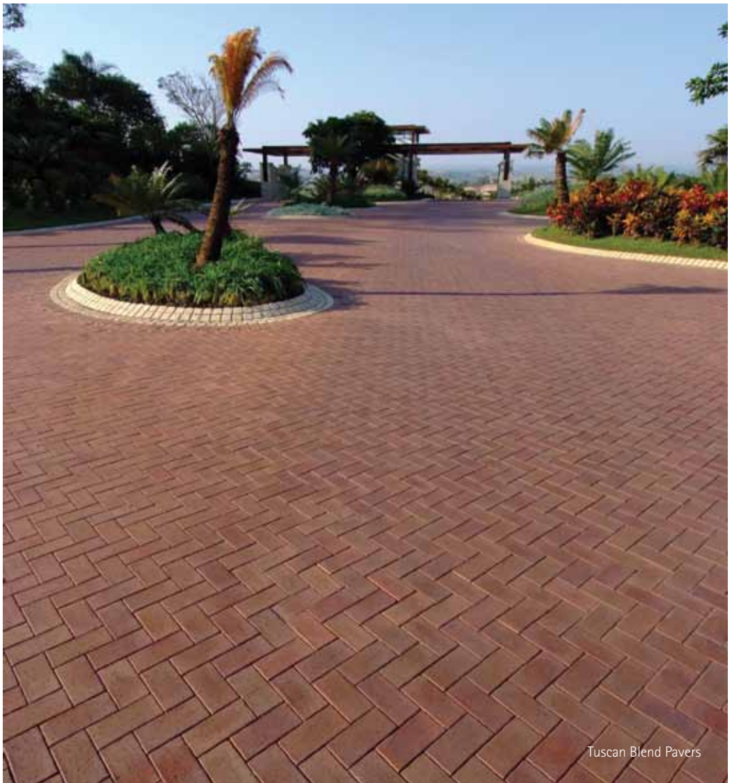
Tuscan Blend Pavers