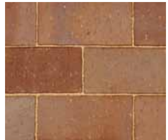
NUTMEG PAVER PA (SABS 1575:2007) (ISO 9001:2008) 220 x 108.5 x 50mm/200 x 98.5 x 65mm (Chamfered and Nibbed). Available in special shapes and bullnose. Springs Factory – Gauteng