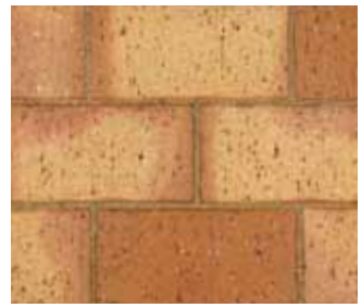
CEDERBERG PAVER PA (SABS 1575:2007) (ISO 9001:2008) 220 x 108.5 x 50mm/200 x 98.5 x 65mm (Chamfered and Nibbed). Available in special shapes and bullnose. Springs Factory – Gauteng