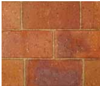
TUSCAN BLEND PAVER PA (SABS 1575:2007) (ISO 9001:2008) 220 x 108.5 x 50mm/200 x 98.5 x 65mm (Chamfered and Nibbed). Available in special shapes and bullnose. Springs Factory – Gauteng