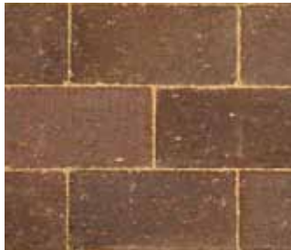
CAPE STORMBERG PAVER PB 200 x 98.5 x 65mm Available in special shapes Phesantekraal Factory – Western Cape