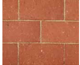
BURGUNDY PAVER PA (SABS 1575:2007) (ISO 9001:2008) 220 x 108.5 x 50mm/200 x 98.5 x 65mm (Chamfered and Nibbed). Available in special shapes and bullnose. Springs Factory – Gauteng