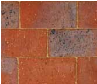
IRONSTONE PAVER PB 220 x 108.5 x 50mm (Nibbed) Springs Factory – Gauteng