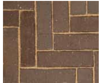
ONYX PIAZZA PAVER PA 210 x 60 x 60mm (Chamfered) Springs Factory – Gauteng